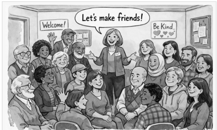
This could be you !!

Perdata.ai, the creator of the Conexus (getconexus.com) private social connection platform has created a Friendship Event Kit, allowing anyone to host a friendship gathering of up to 100 participants without cost. The full kit, which includes a guide, video, invites, PowerPoint and other resources can be found at friendshipevent.com